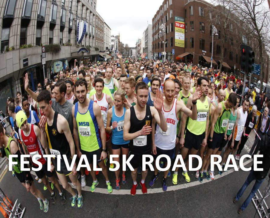
FESTIVAL 5K ROAD RACE