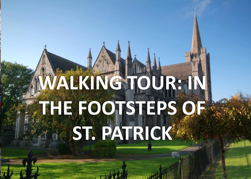
WALKING TOUR: IN THE FOOTSTEPS OF ST. PATRICK